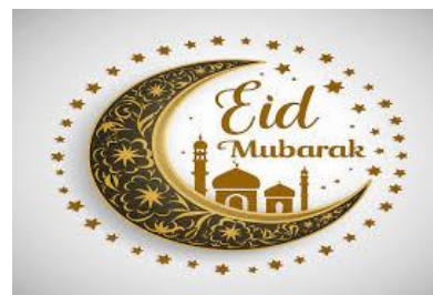
Eid-ul-Fitar: 31 Mar