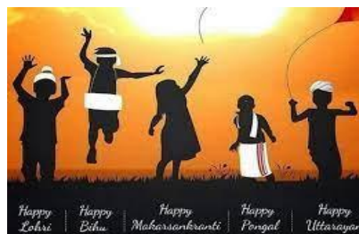
Makara Sankranti/Pongal: 14-Jan