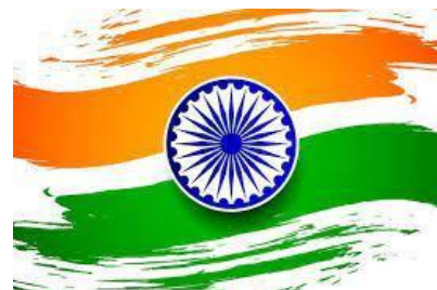
Republic Day: 26-Jan