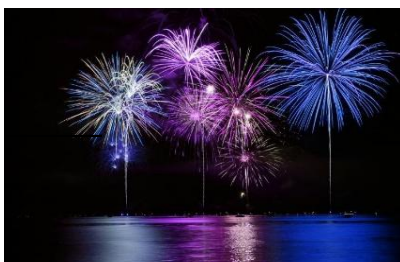
New Years: 1-Jan