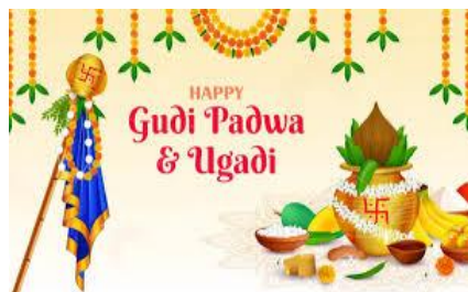
Ugadi / Gudi Padwa: 30-Mar