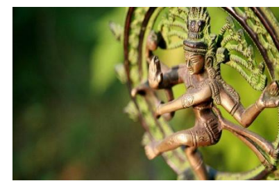
Maha Shivaratri: 26 th February